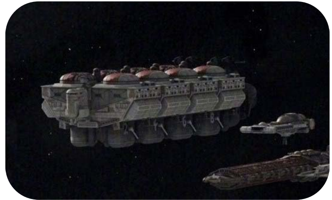
Refinery ship Daru Mozu

The question is what is causing all these breakdowns? The Cylon virus, which recently corrupted Galactica 's environmental systems or human Cylon saboteurs? Perhaps it's just the wear and tear associated with continually jumping the fleet, whatever the cause all ship Captains are advised to carefully review their security procedures.