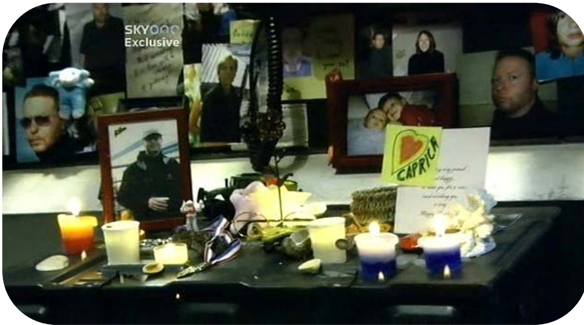
Memorial Hall aboard Galactica